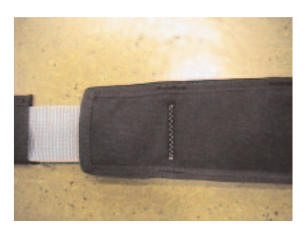
3. Unpick Zig-Zag on Leg Pad.