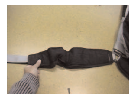
7. Pull Leg Pad back