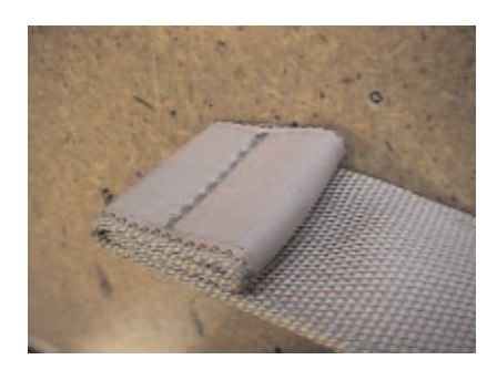
Stitch the TYPE 12 to the end of the Leg Strap. Include the TYPE 12 in the Turned End. Stitch The Turned End With 3 rows of Size "FF" Nylon Thread.