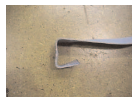
5. Unpick Leg Strap Turned End.