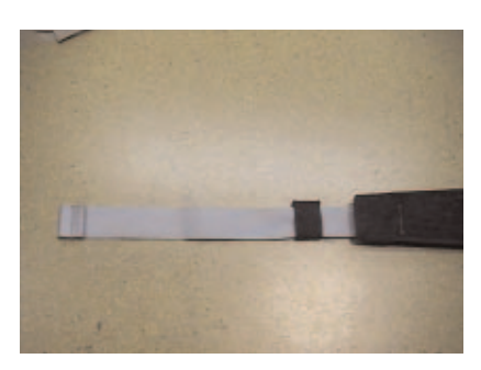
2. Leg Strap TYPE 7 Webbing.