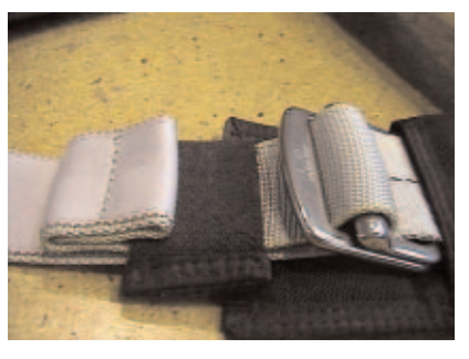
11. Fit Leg Strap to Adjuster. Fit keeper.