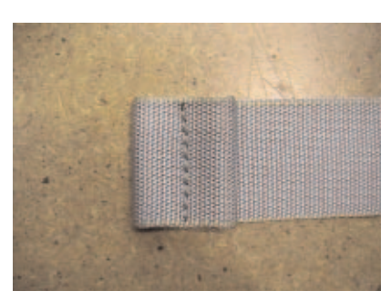
4. Unpick Leg Strap Turned End.