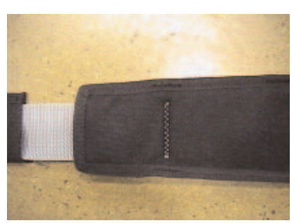
10. Stitch Leg Pad to Leg Strap Using Size "E" Nylon thread. Use Zig-Zag.