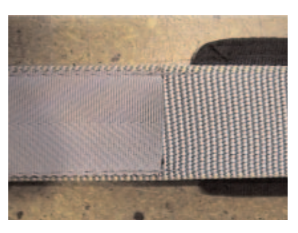
8. Stitch TYPE 12 to TYPE 7 Using single gauge Size "5" Nylon Thread.