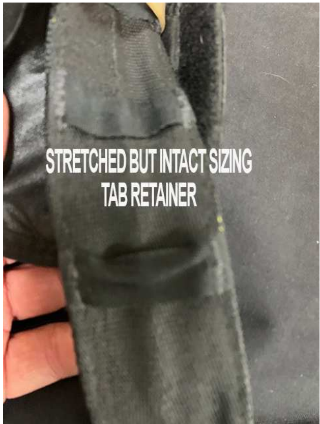
Stretched tab retainer