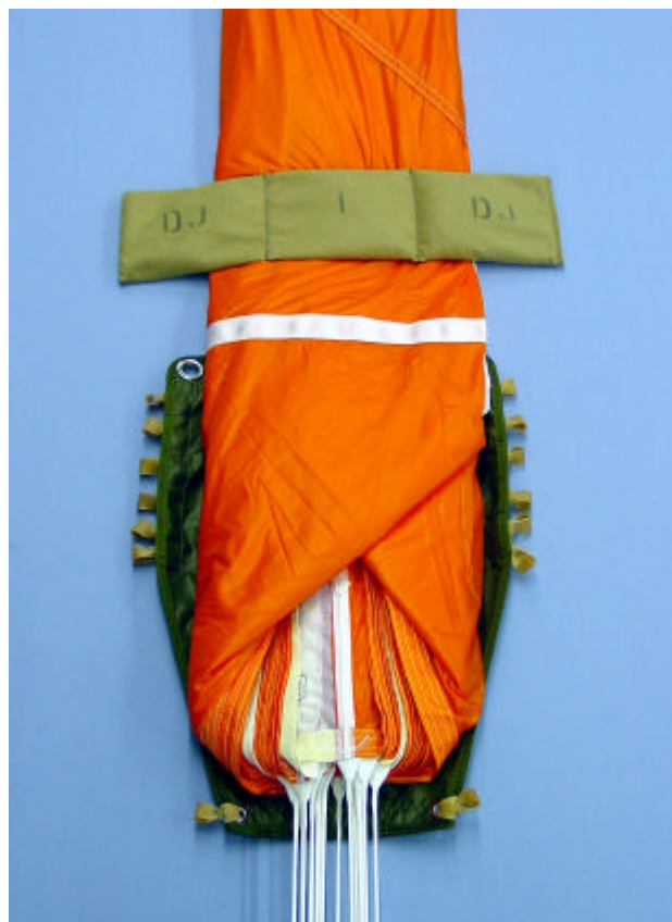
Fig 9 Canopy folded