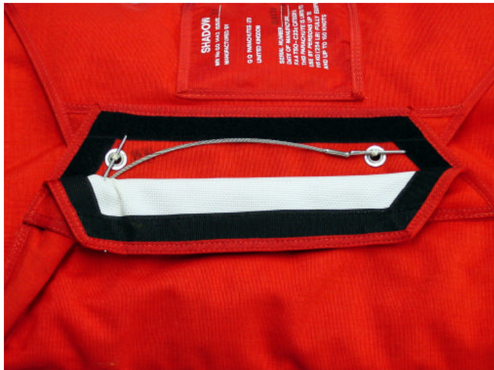
Fig 25 Container closed ripcord pins fitted