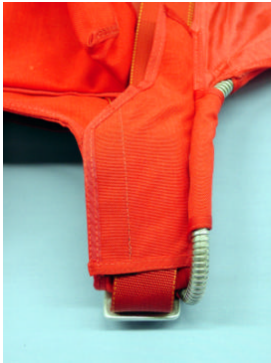
Fig 14 Lift web covers secured