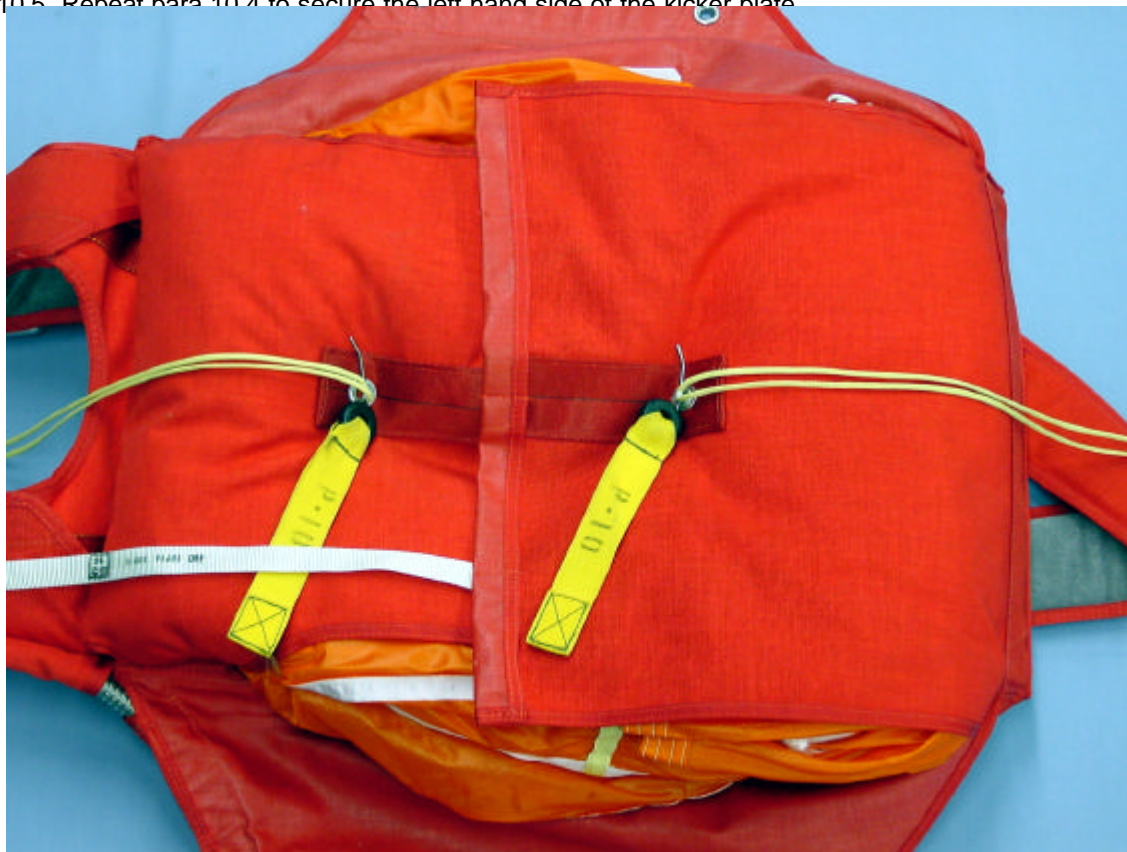
Fig 20 Closing the container : stage 1

10.5 Repeat para 10.4 to secure the left hand side of the kicker plate