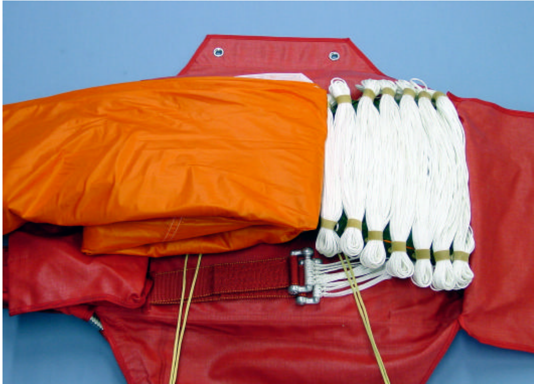
Fig 16 Stowing the canopy : first fold