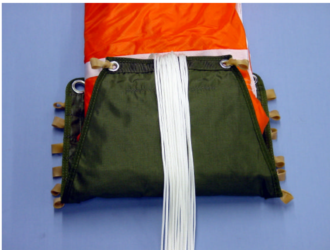
Fig 10 Closing the diaper : stage 1

8.3 Continue stowing the lines into the elastic bands until all bands are filled. Ensure that 305 mm (12 in) of lines remains unstowed. Fig 12 shows all the lines stowed.