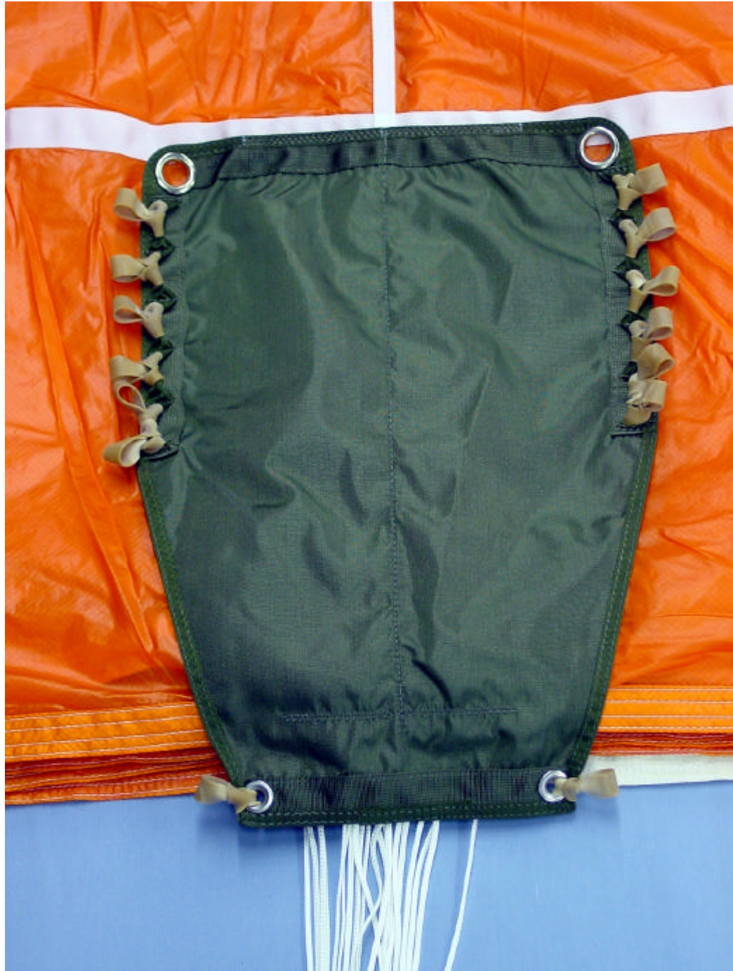
Fig 5 Diaper prepared

5.1 Attach 51 x 13 mm (2 x 0.5 in) elastic bands to each of the webbing tape loops (10 total), attach further bands to the left hand and right lower loops as shown in Fig 5. Attach two further bands to the two eyelets ensuring that they are positioned to the side of the flap as shown in Fig 5 and not to the lower edge of the diaper.