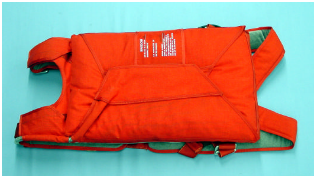
Fig 26 Packing completed