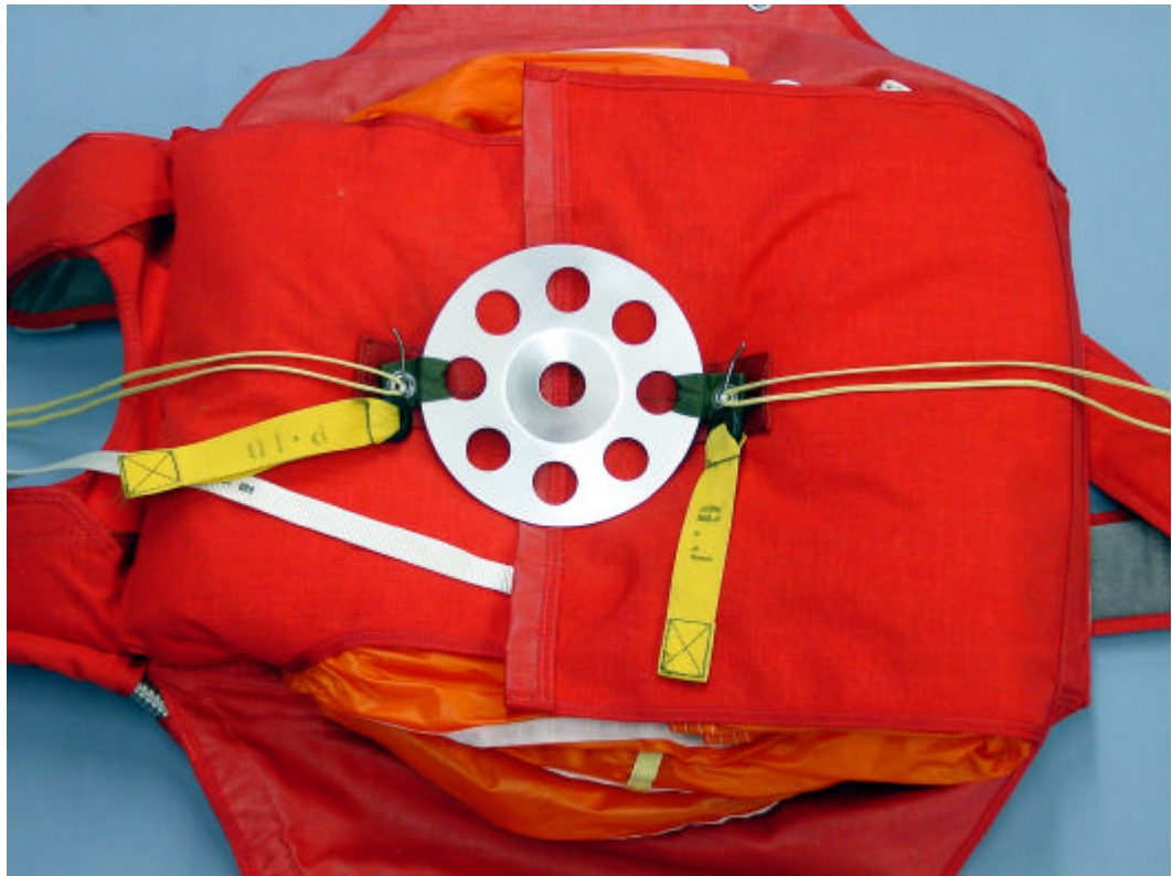
Fig 21 Positioning the kicker plate