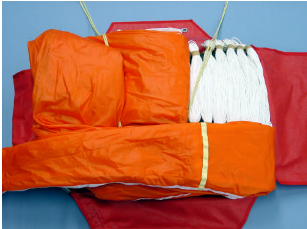
Fig 18 Stowing the canopy : third fold