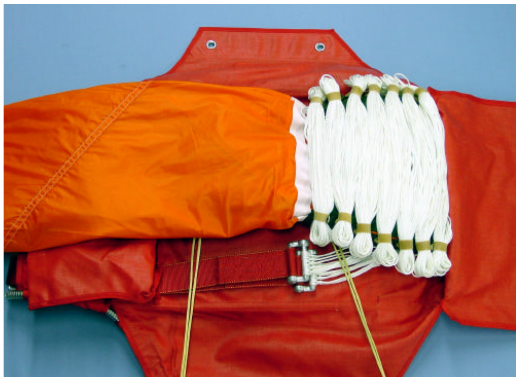
Fig 15 Lift webs and diaper positioned