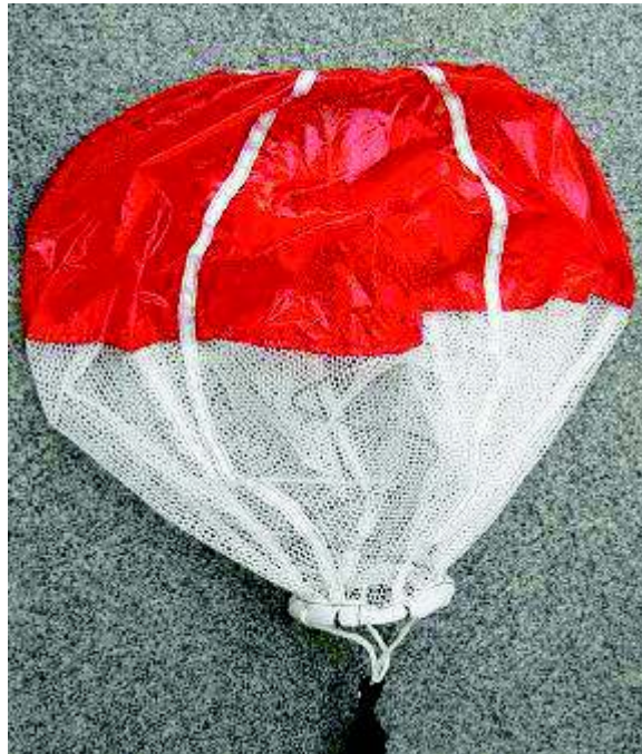
Pilot parachute PV – 038