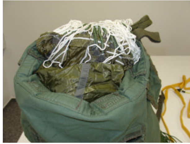
Fig. 13 Fig. 14

The breakcord attaching strap should be pushed into the belt loop pocket in an S-fold. Then the canopy should be placed in the deployment bag in S-folds so that the top lies in the right corner of the pack tray. The base edge lies on the front edge of the pack tray (Fig.14).