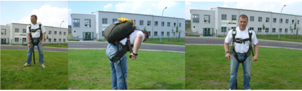
Fig. 26 Fig. 27 Fig. 28