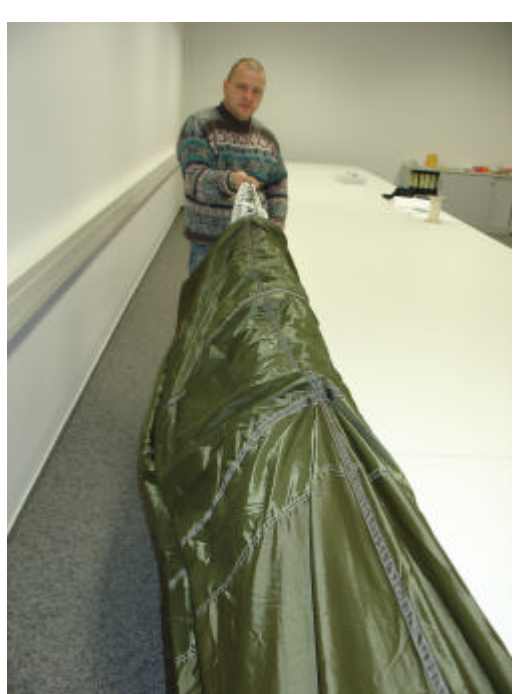
Fig. 6 Fig. 7

Starting with line no. 15, which is still in riggers right hand, go anti-clockwise along the canopy basic and pick up line no. 14. With a smooth continuous movement bring the left hand over the had. When the gore inflates, place line no. 14 on top of line 15. This procedure will be continued till the last suspension line no. 16 (Fig. 7).