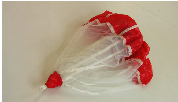
Fig. 1: Pilot chute

Reason: Pilot chutes as part of Emergency Parachutes RE-5L, produced and delivered in-between the above mentioned period, may have damaged (chapped) grommets at the top (see Fig. 2). In extreme case it may happen an obstruction of the closing loop by a damaged grommet and further on the proper opening of the parachute container may be obstructed.