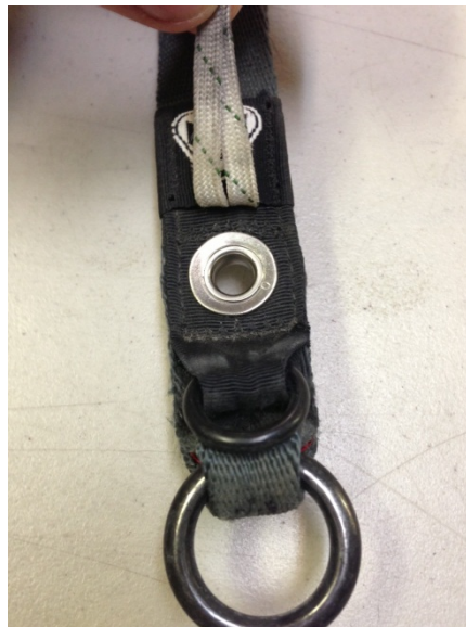
Figure 4: Normal Wear, Back