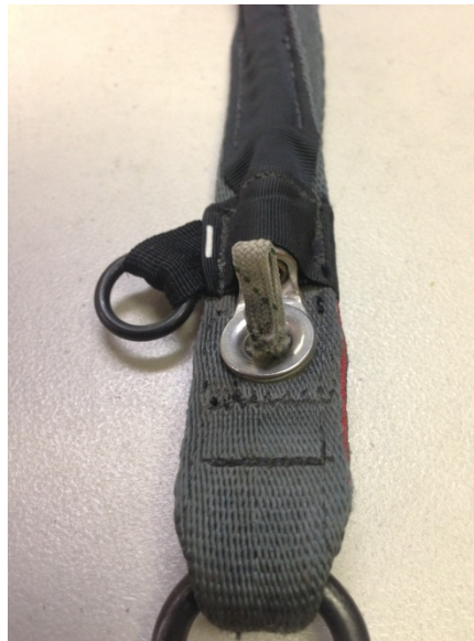
Figure 6: Damaged, Frayed