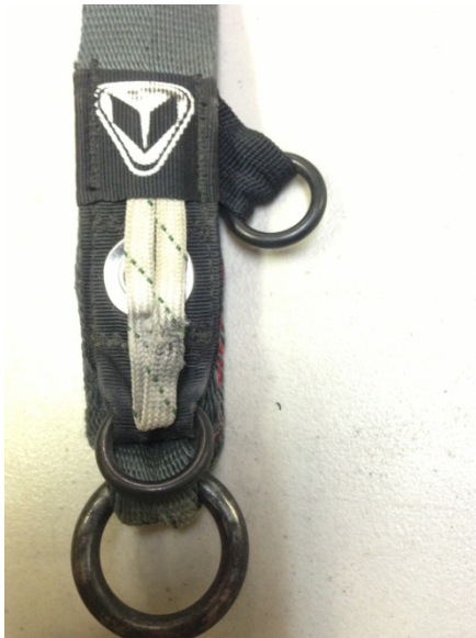
Figure 5: Damaged, Frayed

The following pictures show locking loops with damage; heavily frayed and partially cut.