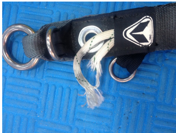
Figure 10: Damaged, Partially Cut