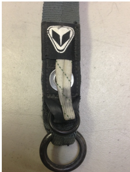
Figure 3: Normal Wear, Front

The following pictures show locking loops with normal wear.