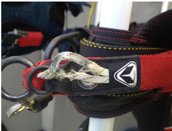
Figure 9: Damaged, Partially Cut