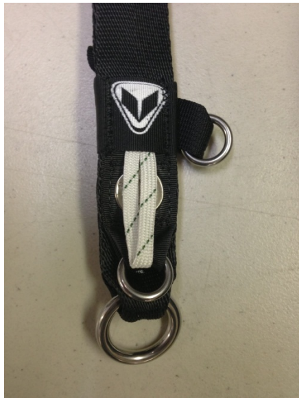
Figure 3: New Locking Loop

The following picture shows a new riser locking loop.